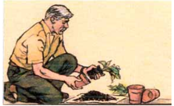
STUART'S GARDEN CORNER